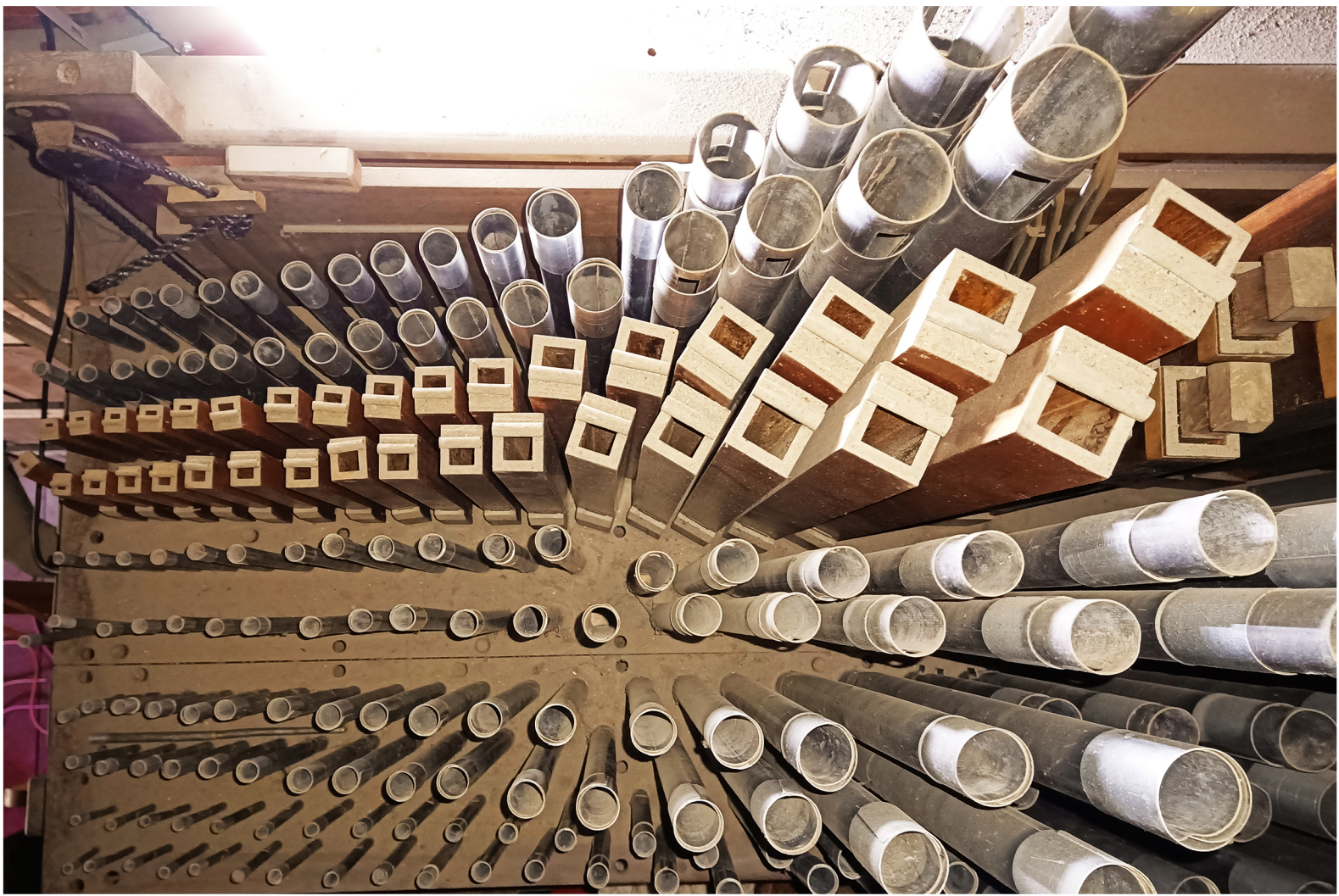
Pipes on the great windchest