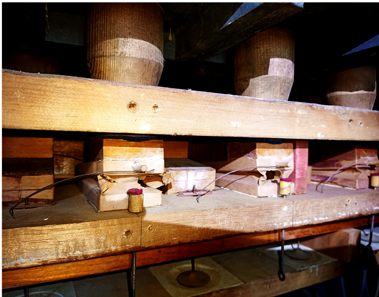
Deteriorated leather in pedal division