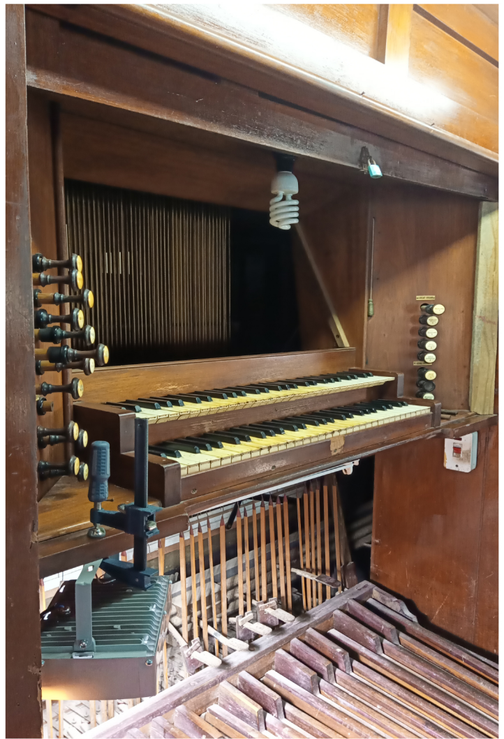
Pedal coppler with broken trackers, now repaired.